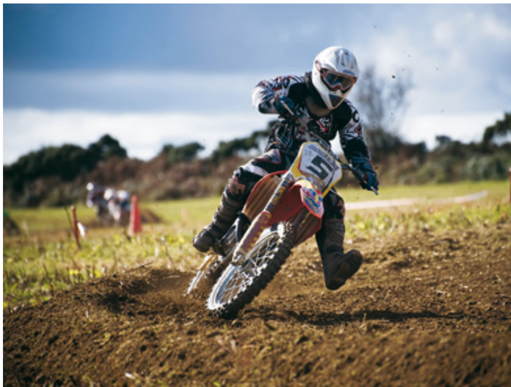
FREEZING ACTION MIDSTREAM —as when a dirt bike racer slows just enough to round a corner—can reveal details missed by the naked eye. Isle of Man, U.K.

Look for a composition that reveals something about the place as well as the person.