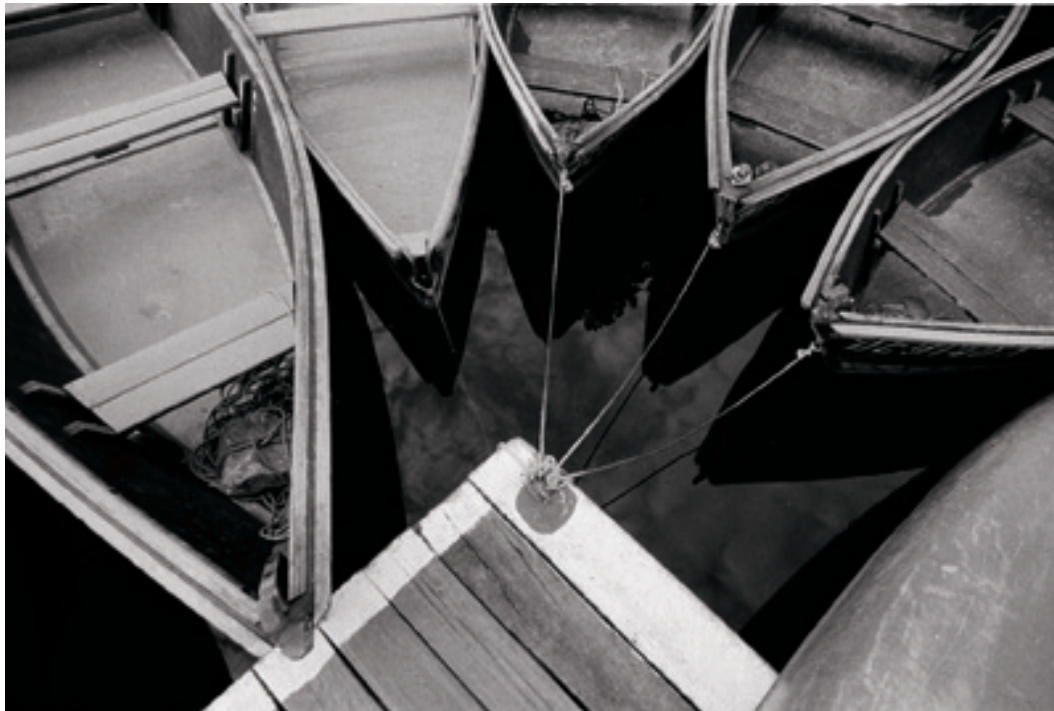
Washington, D.C., U.S.

►► Don’t use the camera rectangle to frame all your pictures. Look for other framing possibilities within the scene, such as an arch or the shaded walls of a canyon.