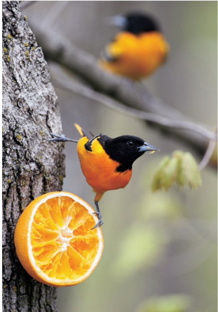
THE BALTIMORE ORIOLE investigating an orange in the foreground—clearly this photo's focal point—creates an energetic counterweight to the bird out of focus behind.

Always think about what you are trying to say with an image. If you are making a photograph of an isolated farmhouse on the prairie, it must be large enough so that people can see what it is, but it shouldn't fill so much of the frame that the viewer loses the sense of its environment.