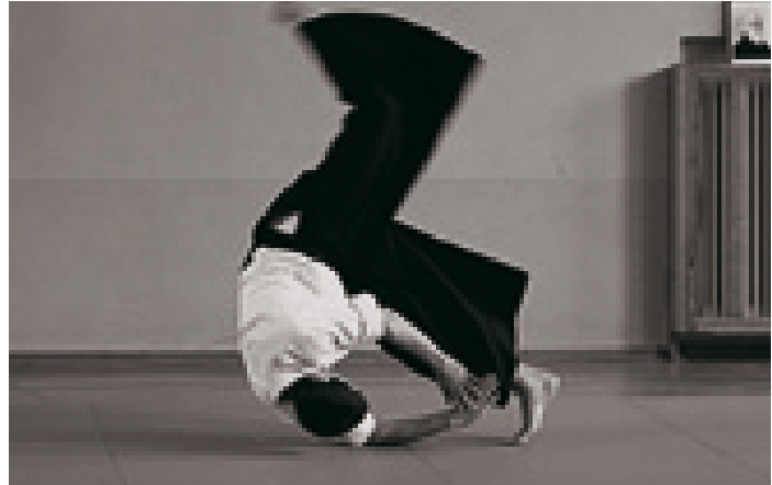
Andrej Pirc/National Geographic My Shot Slovenia

BLACK-AND-WHITE PHOTOGRAPHY allows the photographer to present an impressionistic glimpse of reality that depends more on elements such as composition, contrast, tone, texture, and pattern. In the past, photographers had to load black-and-white film in the camera. But with digital photography, you can convert your color images on the computer or, on most cameras, switch to black-and-white mode—good for practice but not the best for quality.