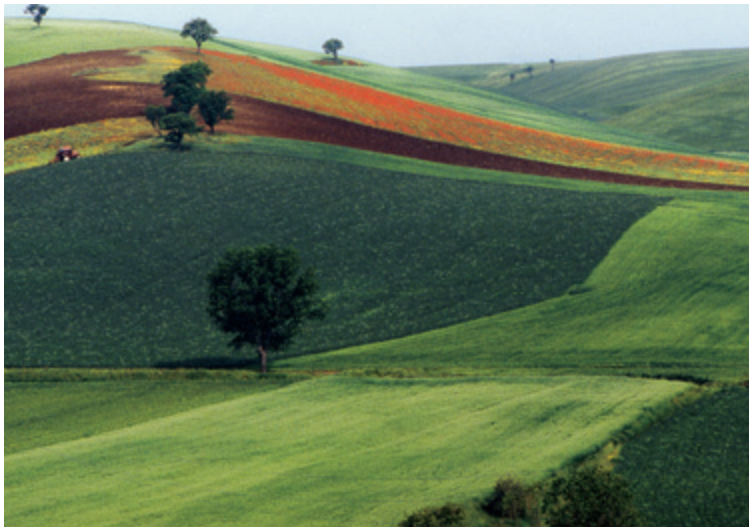
Puglia, Italy

In every carefully considered photographic accomplishment, four elements are vital: subject, composition, light, and exposure. In this book, we will use the shorthand of the icons below to highlight the choices that make a successful photograph.