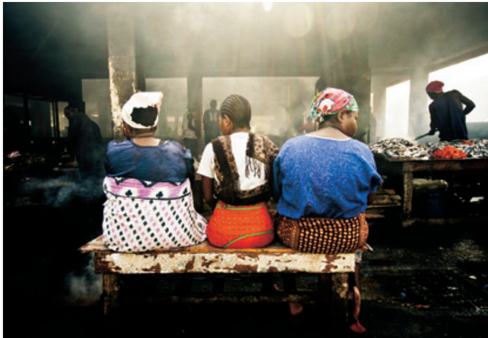
Chasen Armour/ National Geographic My Shot Tanzania

►► Since we usually look for details, it can be harder to see blocks of color or shape. Squint a bit. Details will blur, and you will see things as masses.