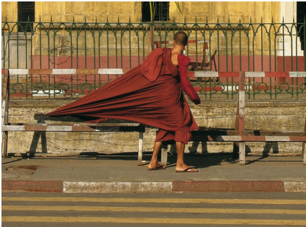
Sharon Tenenbaum/National Geographic My Shot Myanmar

Hire a guide to take you places that tourists don't normally go. Choose someone of the local ethnicity—they know the language and customs.