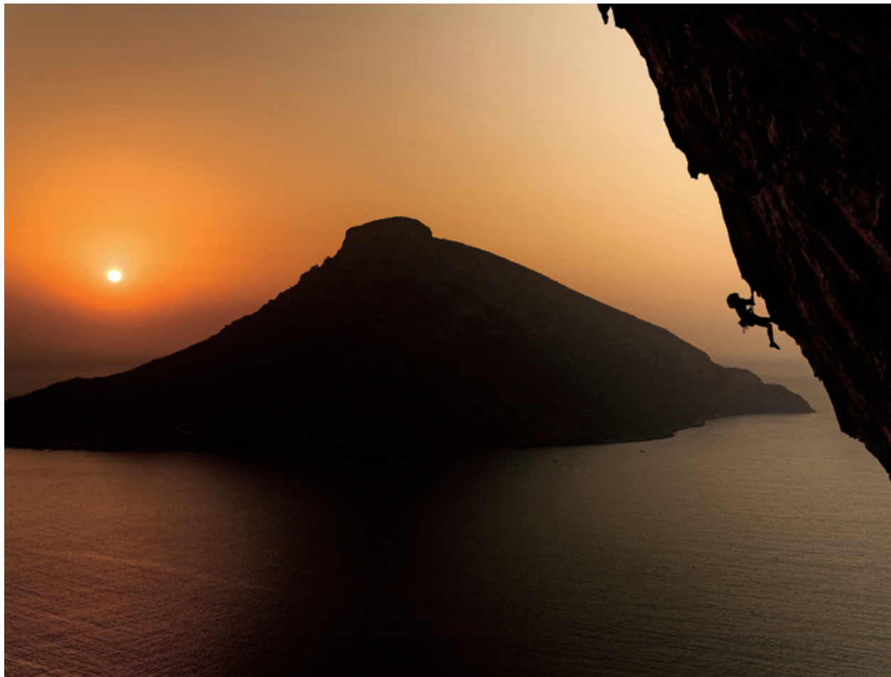
Lukasz Warzecha/National Geographic My Shot Greece

When shooting portraits , try backing up a little to include the environment around the person.